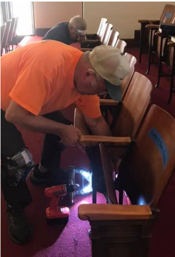
Sanctuary Renovation 2020